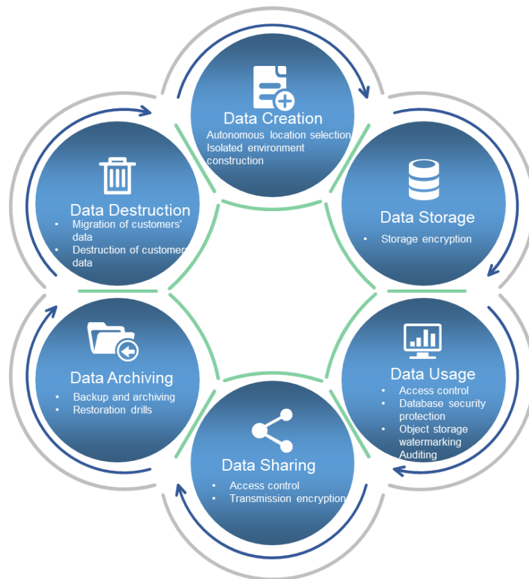
Figure 4-1 Key protection measures in different phases of data lifecycle