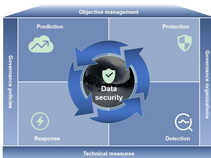
Figure 5-1 Key protection measures

Huawei has built a cloud data security system that integrates prediction, protection, detection, and response capabilities. The system, together with scenario-oriented defense measures, ensure data security on the cloud.